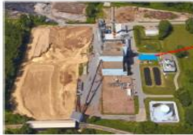
McNeil Proposed Central Energy Center Location